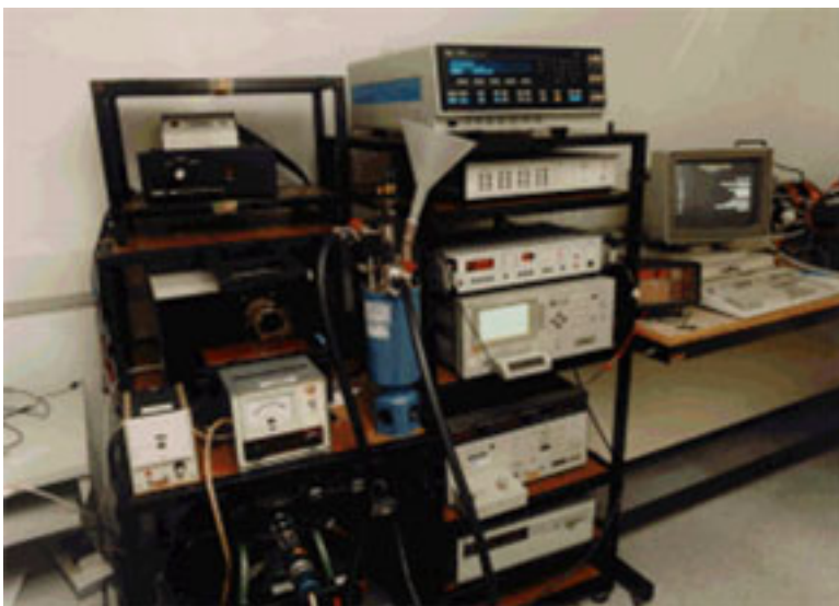
Image sensors often require multiple low-noise power sources and a variety of digital control lines. Digital image data and associated synchronization signals are output by image sensors, as are additional status and control lines that allow functions such as reset, standby, flash or